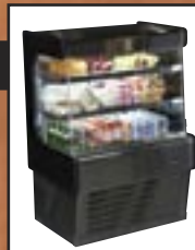
Grab N Go