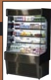
Grab N Go Tower