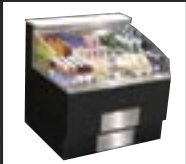
Grab N Go Lowboy