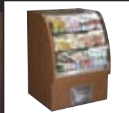
Grab N Go Frontline