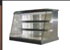
Grab N Go Counter