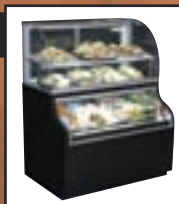
Grab N Go Combo